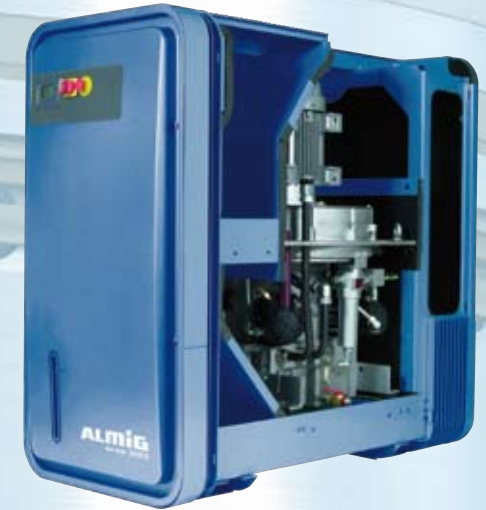
HP, in standard soundproof housing